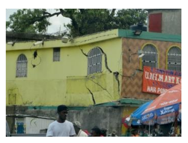
The grocery store we frequented is unstable and could fall at any time.

We are thankful when we can find gasoline in the gas stations and propane at the dealers when it is reasonably priced. That's not the case with other commodities. Much like in the States, prices in the grocery store have skyrocketed. Sometimes we are paying two to three times the original price. The shelves are nearly bare. The store where we purchased much of our food was damaged in the earthquake and deemed unsafe.