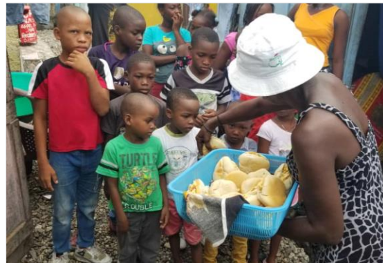
A caring community member prepares food and serves breakfast to local children. They are served bread with peanut butter OR bread with scrambled eggs and herring before heading to school.