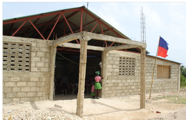
Grace School of Boisbouton, Île-à-Vache