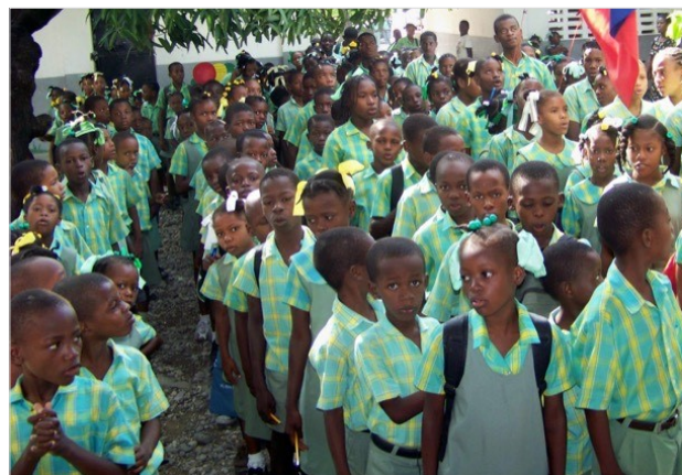
First Lutheran School of LesCayes