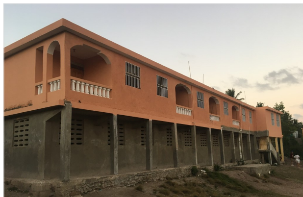
Grace School of Grann Plaine, Île-à-Vache